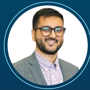
Faisal Nawaz Al-Amal Hospital (UAE)