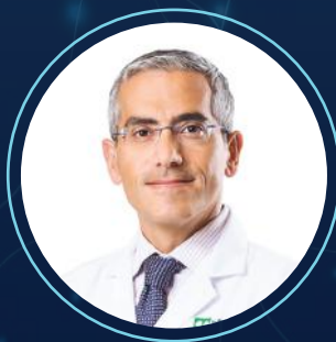
Naim Aoun American Hospital Dubai (UAE)